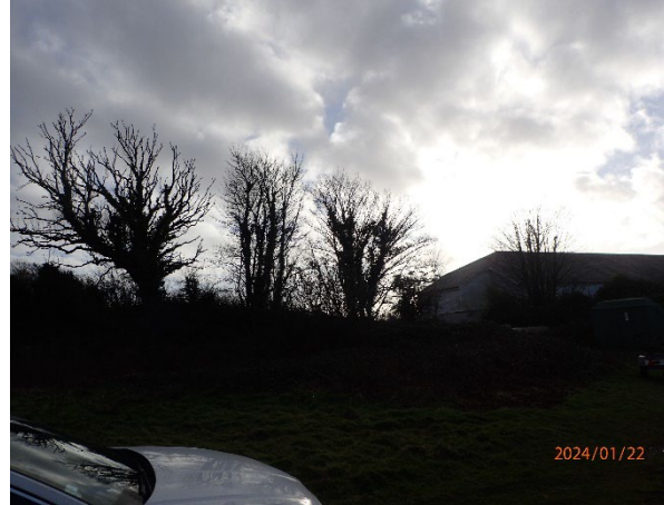
Tree ID#T1 + G5